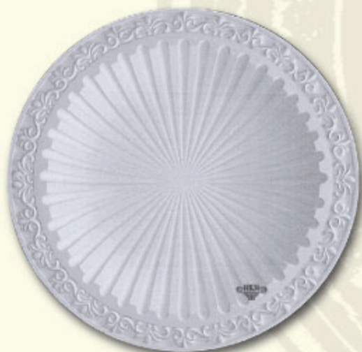
HKH DM19 Ø 1000 x 135 D (39 \frac{3}{8} " x 5 \frac{5}{16} " )