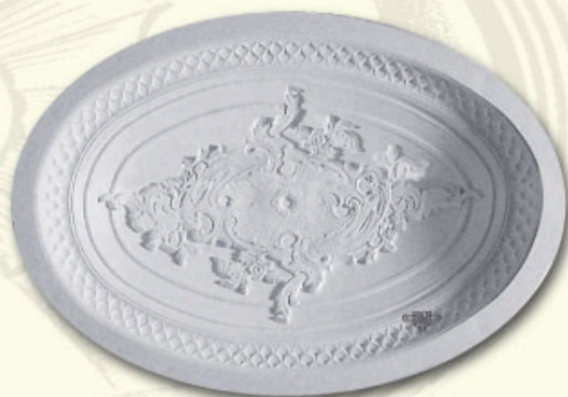
HKH DM24 1220 x 890 (48" x 35 \frac{1}{16} " ) Depth: 200 (7 \frac{7}{8} " )

155 6 \frac{1}{8} " 875 34 \frac{7}{16} "