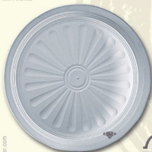
HKH DM7 HKH DM28 ( 1/4 pc)