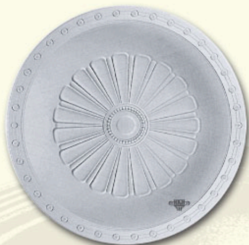
HKH DM20 Ø 900 x 180 D (35 \frac{7}{16} " x 7 \frac{1}{16} " )

125 4 \frac{15}{16} " 1235 48 \frac{5}{8} "